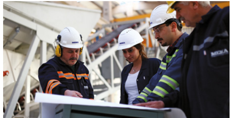
Scenes from MEKA Factories